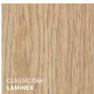
CLASSIC OAK LAMINEX