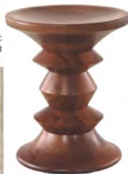
EAMES WALNUT STOOL C HERMAN MILLER