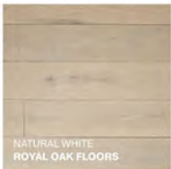
NATURAL WHITE ROYAL OAK FLOORS