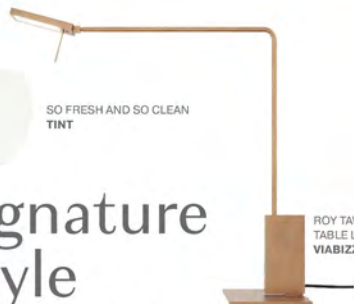
ROY TAVOLO TABLE LAMP VIABIZZUNO