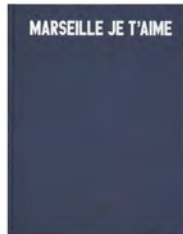
MARSEILLE JE T'AIME