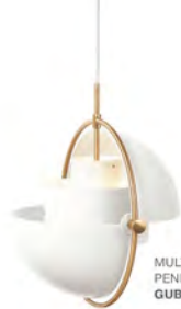
MULTI LITE PENDANT GUBI