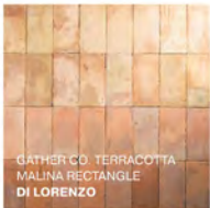
GATHER CO TERRACOTTA MALINA RECTANGLE DI LORENZO