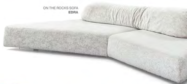
ON THE ROCKS SOFA EDRA