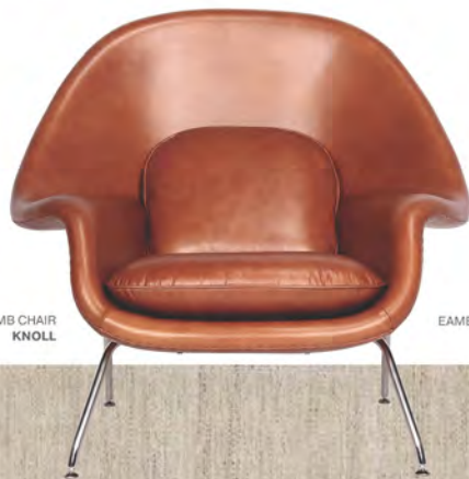
WOMB CHAIR KNOLL